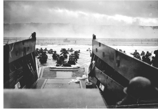
Normandy landing beaches