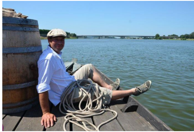
Cruise on the Loire