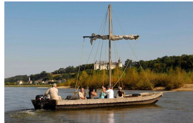
Private cruise on the Loire River