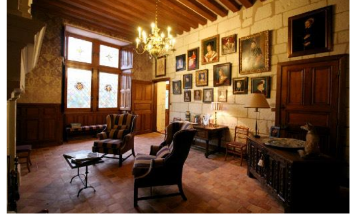
Private dinner in a chateau