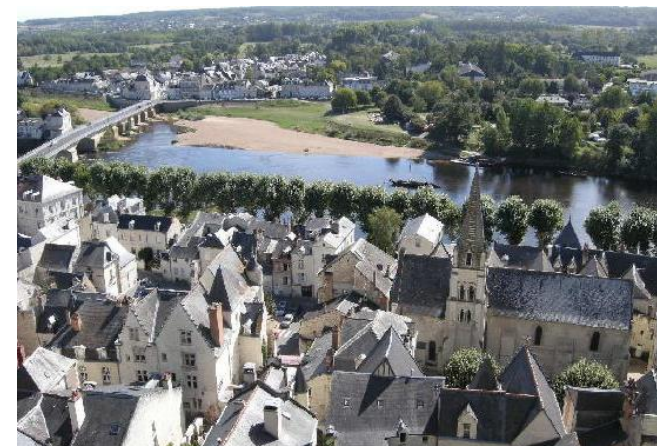
Chinon town guided tour