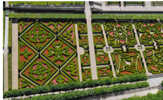
Villandry Chateau and gardens