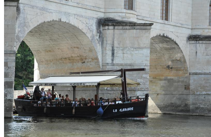
Private boat cruise under Chenonceau castle