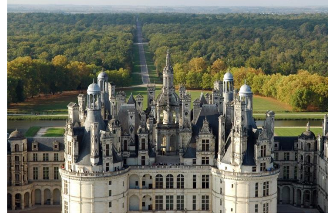
Chambord Château VIP tour