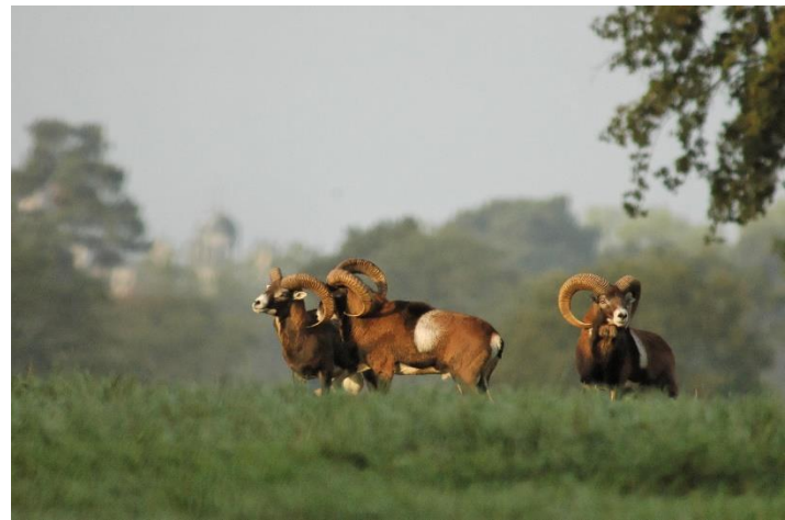
Chambord castle forest park 4x4 private guided tour