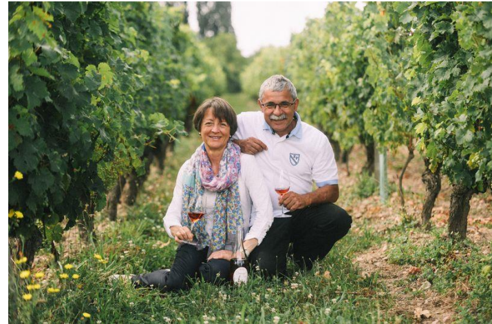
Winery in Chinon wine region