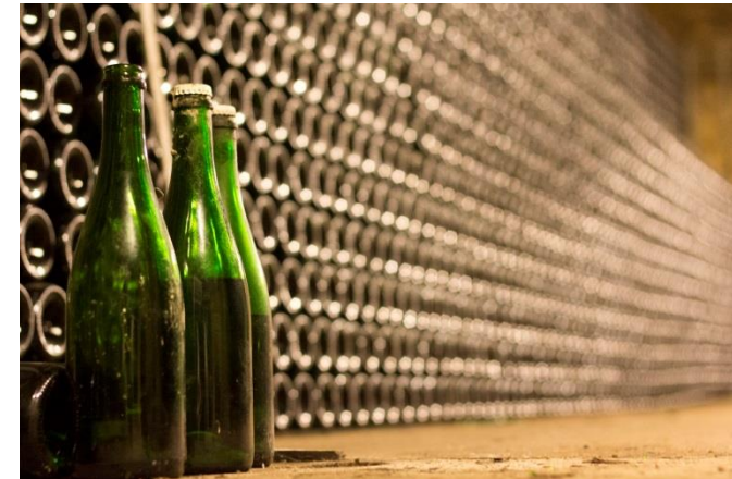
Winery in Vouvray wine region