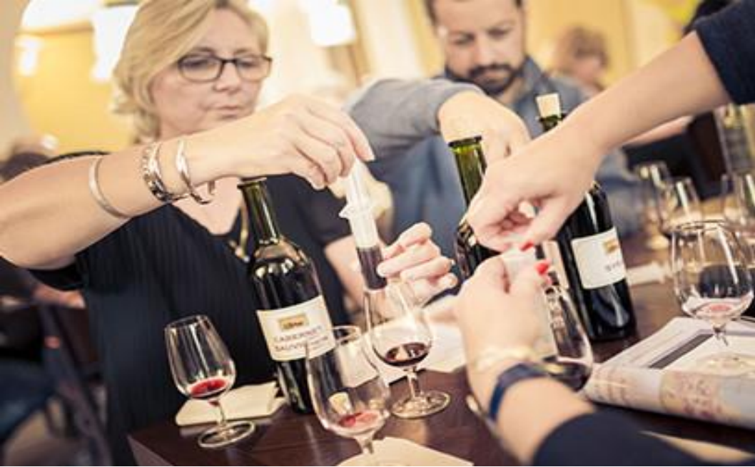
Wine making workshop