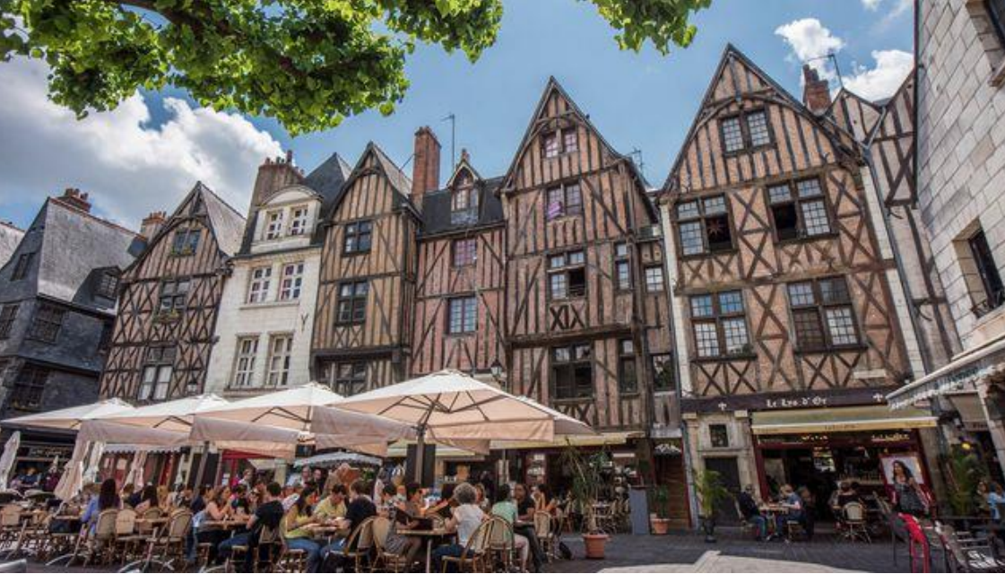
Food market and immersion with a local