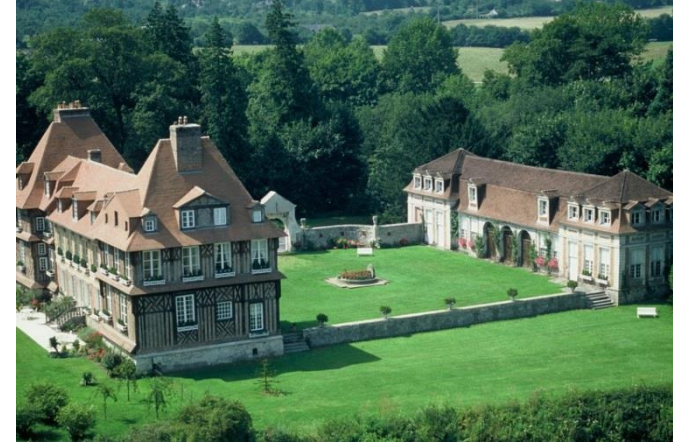
Gourmet tour in Pays d'Auge