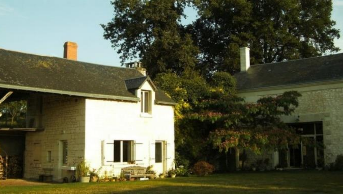
Cooking class in a Chef home