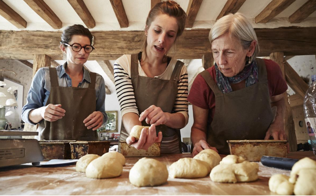
Bread baking workshop